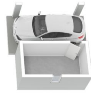
Upper Ground Floor