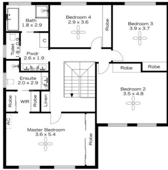
First Floor INTERNAL 253 m 2