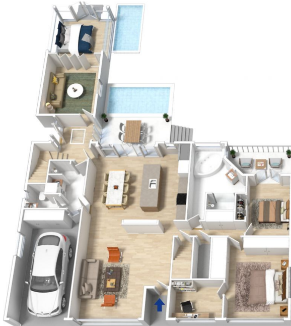
A 3D perspective rendering of a modern apartment floor plan. The layout includes a dining area with a white rectangular table and four chairs, a kitchen with a dark countertop and a sink, a living area with a dark grey sofa and a coffee table, a bedroom with a bed and a nightstand, and a bathroom with a toilet and a sink. The apartment features light wood flooring and white walls.