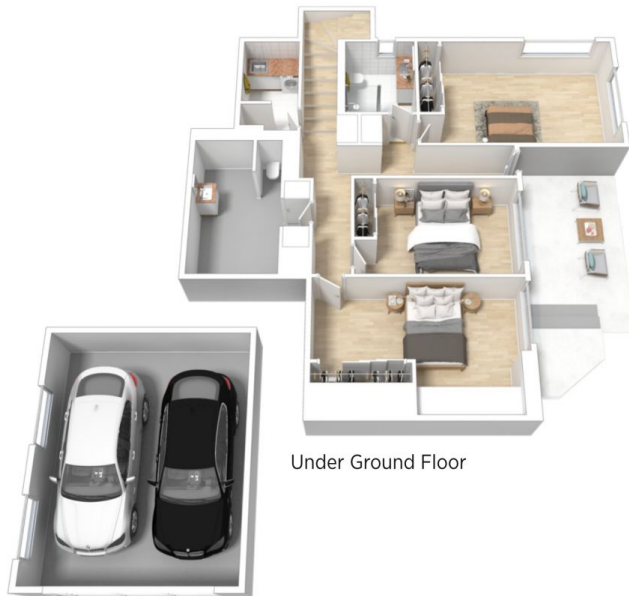
Under Ground Floor